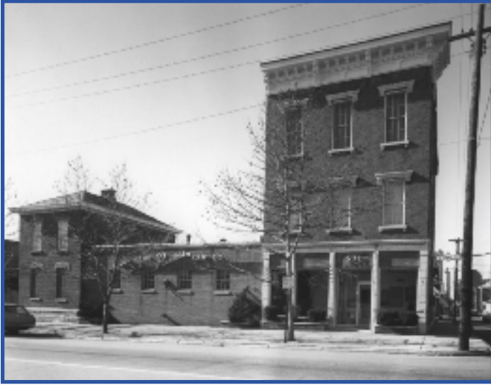
Peerless building in German Village

The Peerless Saw Company was founded when Thomas Edison was still filing patent applications, the Empire State Building was newly built and the world economy was crawling out from under the Great Depression. In 1931, brothers from two families, the Hodapp's and the Callahan's pooled their resources and formed a new saw blade manufacturing company in Columbus, Ohio. Their first order was to supply wood cutting bandsaw blades to the Ford Motor Company in Detroit.