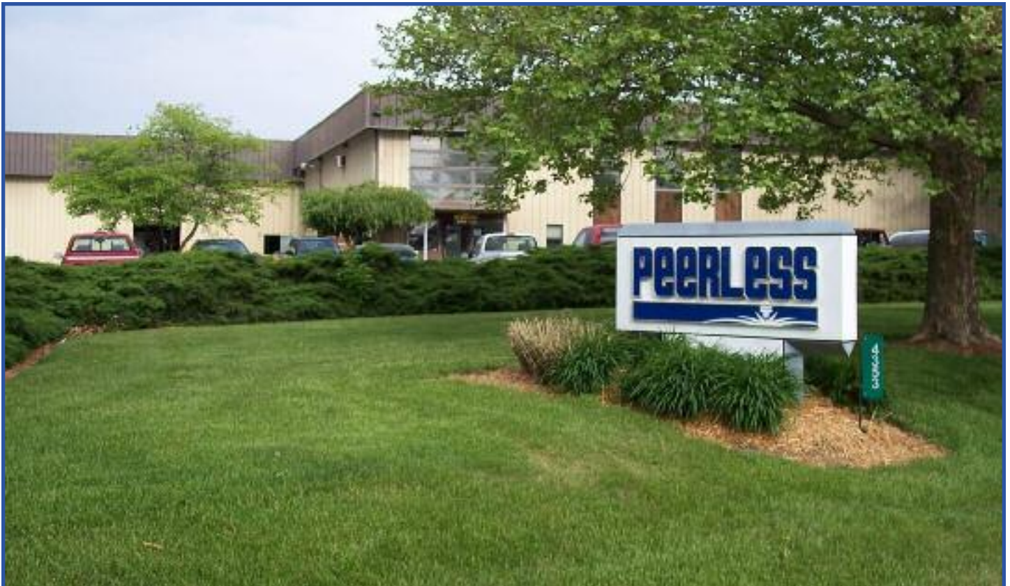
Peerless building in Groveport

Peerless has been a member of the ISKA since 1980 and has hosted numerous hammering seminars and receptions. The company is proud of its history with the organization and looks forward to many future years as an active member.