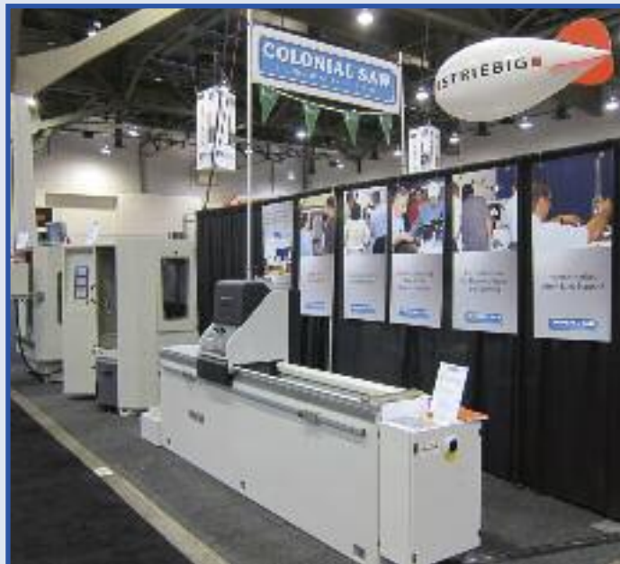
MVM MX Knife Grinder with Touch Panel Controller from Colonial Saw